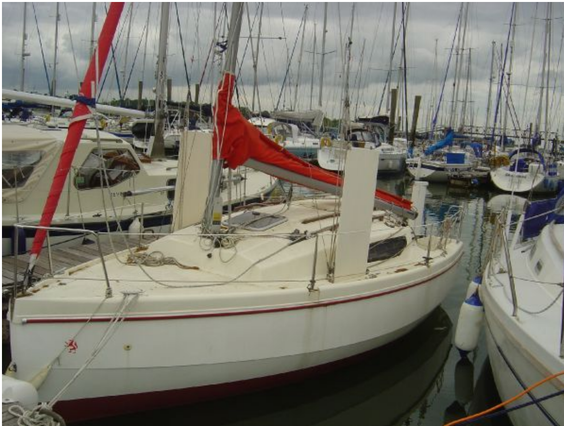
A full-size Red Fox 20

Paul Boot talked about his 1:5 model of a Red Fox 20, a sailboat design he developed and manufactured in the 1990s.