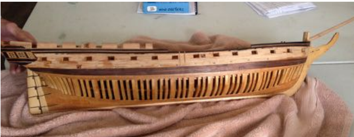
U.S. Frigate Essex, 1799

The Essex is famous for her exploits in the Quasi War with France, the Barbary Wars and the War of 1812 when she took the war into the Pacific and did irreparable damage to the British whaling fleet before she was finally cornered and captured off Valparaiso.