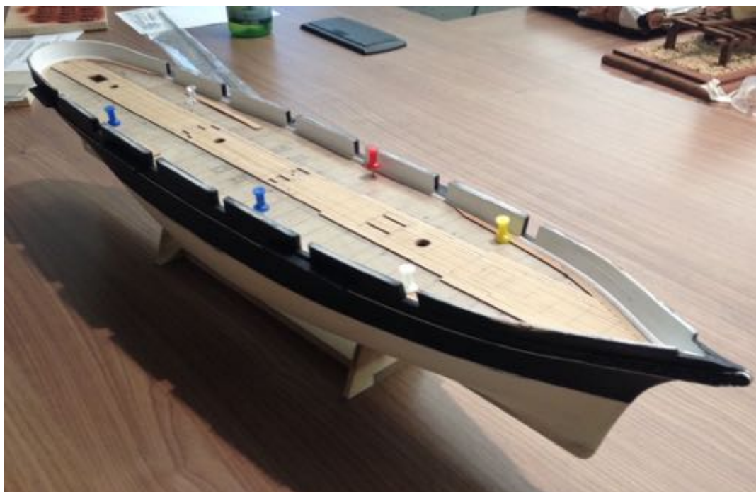
Kanrin Maru from a modified Woody Joe kit

A second model in progress brought for comparison – a 1/96-scale scratch built model of the U.S.S. Saginaw, which was the first ship built at the Mare Island Naval Shipyard in 1859.