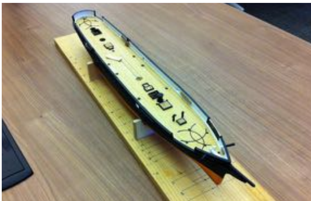
USS Saginaw plank on lift built hull