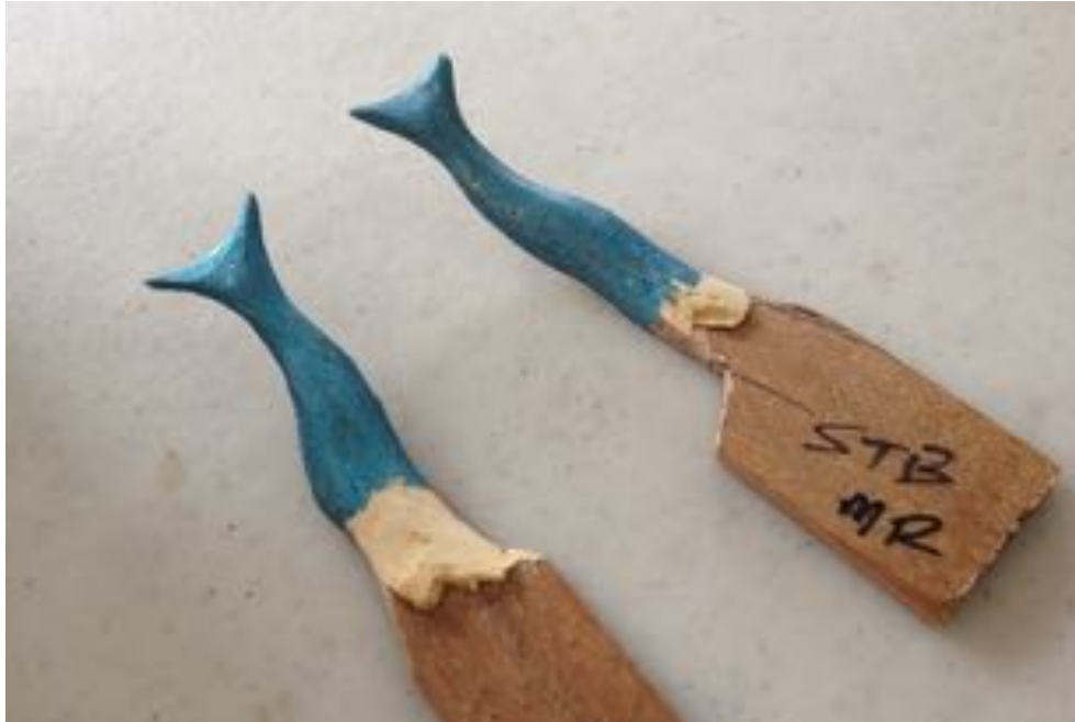
Neptune's hindquarters for the Sovereign of the Seas

Warren Gammeter brought in the figurehead he's been working on for his model of the Donald McKay clipper ship Sovereign of the Seas in 1/96-scale. The figurehead is based on contemporary paintings of the ship, which shows a King Neptune figure blowing into a conch shell. This particular figurehead has the characteristic of being split into a "Y" shape, as the tail end extends on either side of the hull aft of the stem.