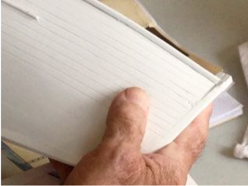
Close up of the grooved hull of the Pat Pending