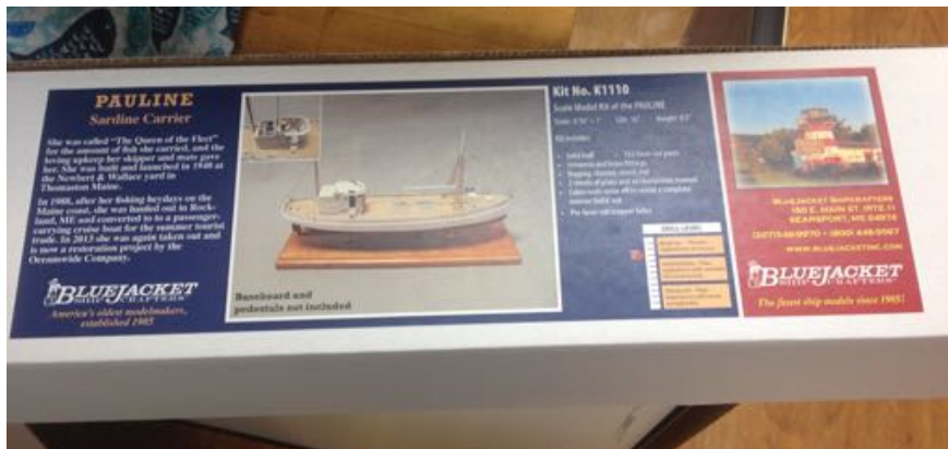
Pauline – BlueJacket’s new kit at Ages of Sail.