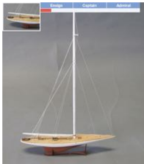
BlueJacket’s recent re-release of the 1934 America’s Cup J-Boats